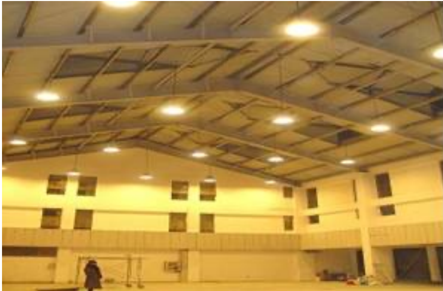
Before HPS Lighting Fixtures 150 W