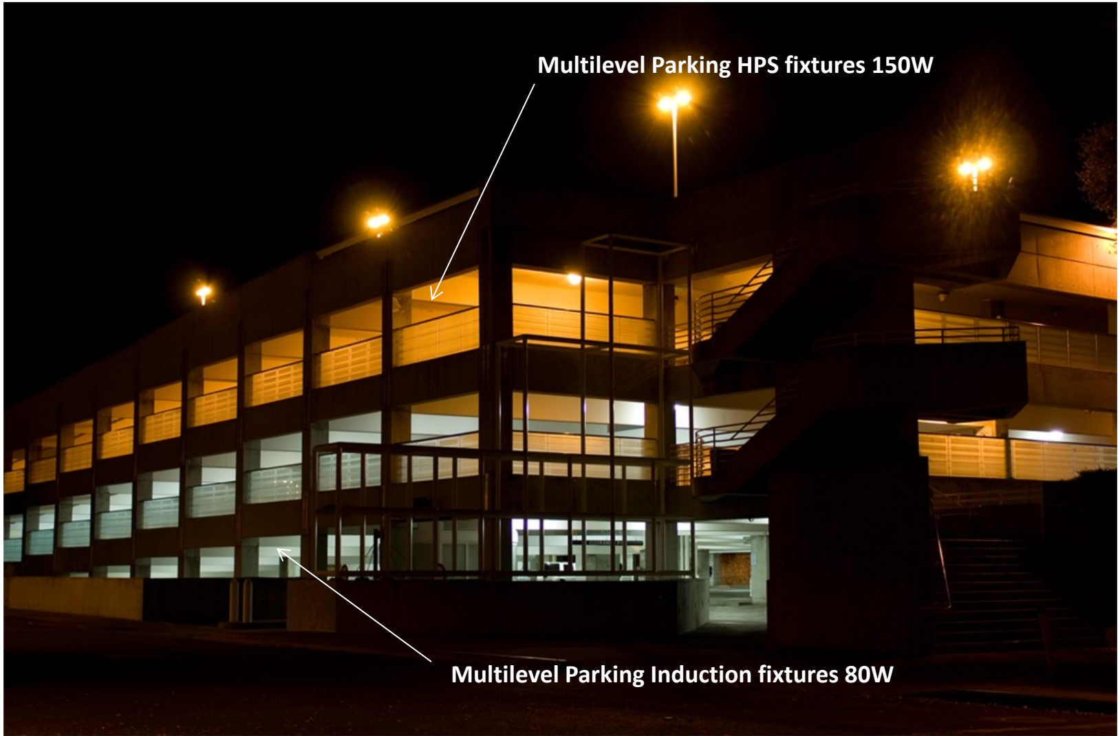
Multilevel Parking HPS fixtures 150W